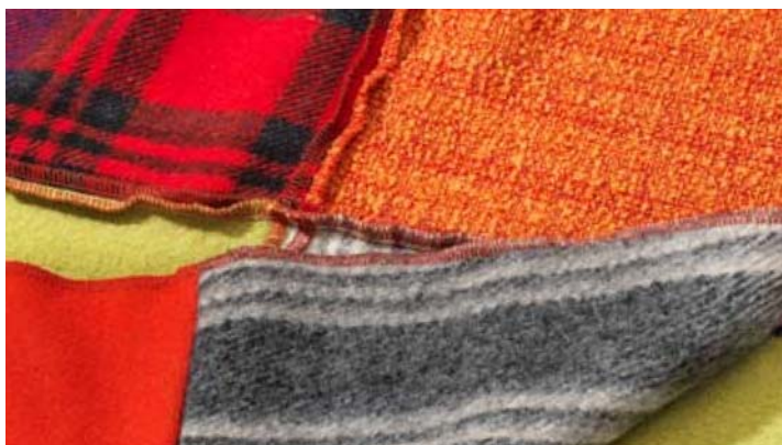
Overlock stitches look so professional you'll be tempted to turn wrong sides right.

The Exclusive SEWING ADVISOR® feature on the HUSKYLOCK™ s25 machine instantly sets the best stitch length, differential feed, and thread tension for the chosen stitch and recommends needles and more for perfect results. Simply enter the type of fabric you are sewing and the settings change automatically.