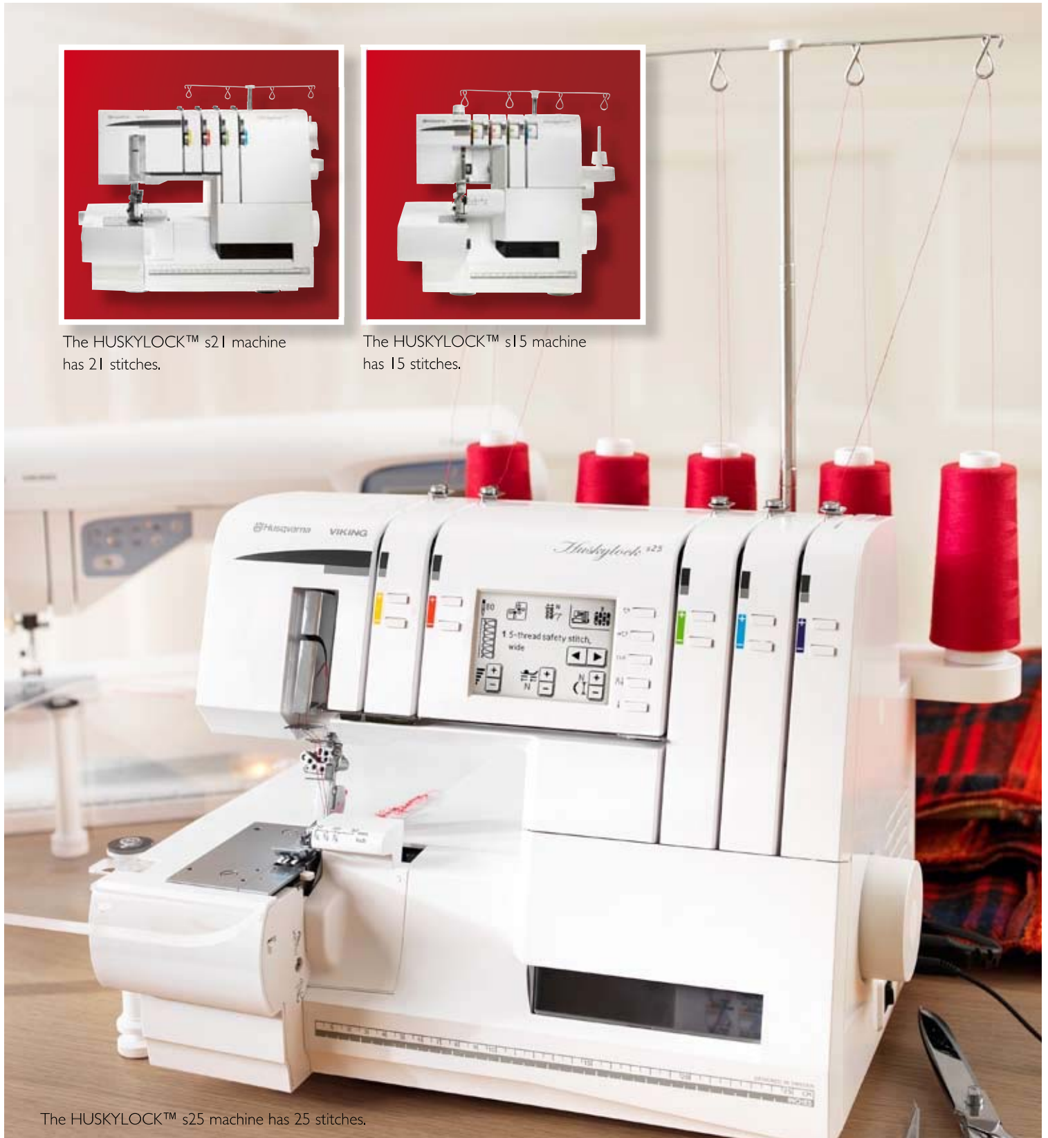
The HUSKYLOCK™ s25 machine has 25 stitches.

The stunning garments and home dec items shown are anything but ordinary. Just like the HUSKYLOCK™ overlock machines, they are innovative from the inside stitches to the outside hems and will inspire you to create unique projects that showcase the convenience and joy of owning a HUSKYLOCK™ overlock. Whether you are just starting your serging journey or are an experienced enthusiast, the HUSQVARNA VIKING® overlock family has an option for you. Your ideal sewing companion awaits.