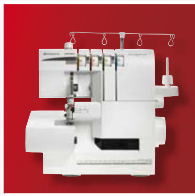
The HUSKYLOCK™ s15 machine has 15 stitches.