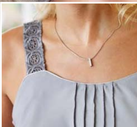
Camisole with beautiful overlock pintucks and embroidered straps.