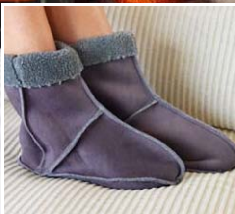
Comfortable slippers with overlock stitches.