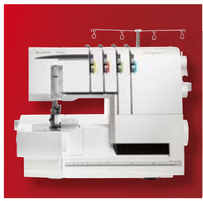
The HUSKYLOCK™ s21 machine has 21 stitches.