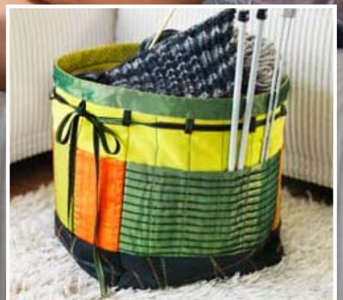
Knitting basket with decorative overlock stitching and pockets for needles.