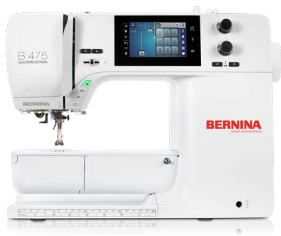
BERNINA 475 QE